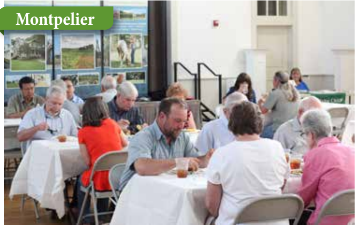
Good food and conversation were had by all at the Montpelier Center for the Arts and Education.