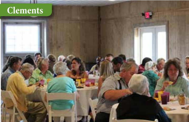
Customers enjoy a nice dinner at Belmont Farm in Maryland.