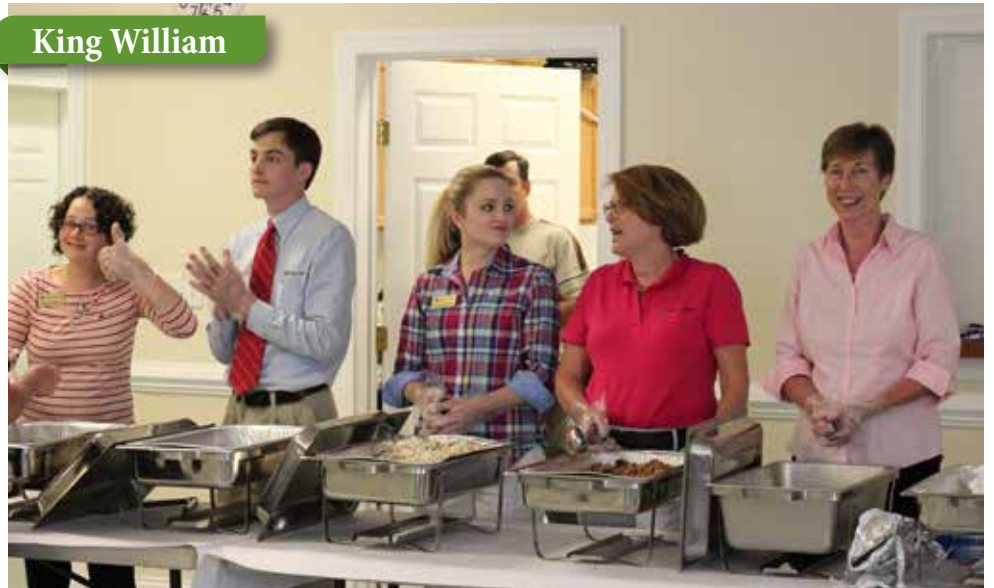
Colonial employees are gloved up and ready to serve their customers at the King William Ruritan Club!