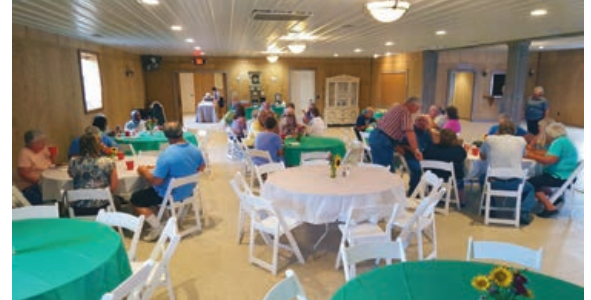
Hughesville customer appreciation event at Rita B's Barn