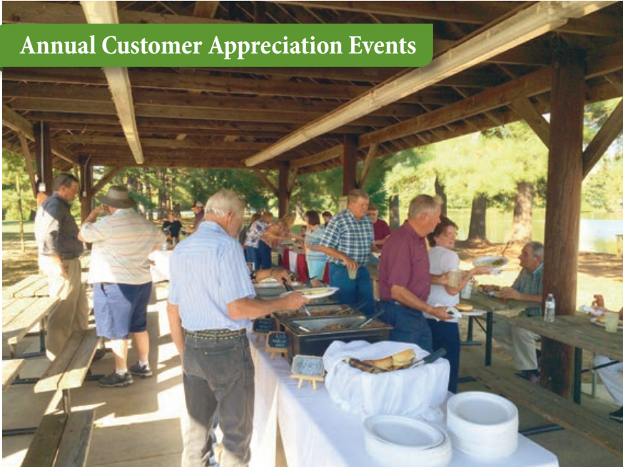
Farmville customer appreciation event at Wilck's Lake Isle