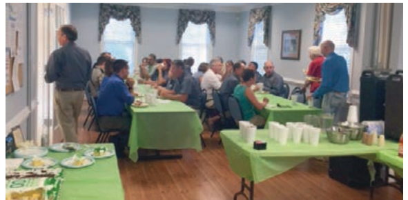
Windsor customer appreciation event at the Colonial Farm Credit Windsor office