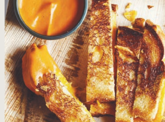
Recipes by Bon Appétit.

2. Heat a dry skillet, preferably cast-iron, over medium heat. Dividing evenly, spread room-temperature butter over bread slices. Top unbuttered side of 8 slices with cheddar, dividing evenly. Top with remaining bread, buttered side up, and cook, turning once, until bread is golden brown and cheese is melted, about 3 minutes per side. Cut sandwiches into soldiers and serve alongside hot soup for dipping.